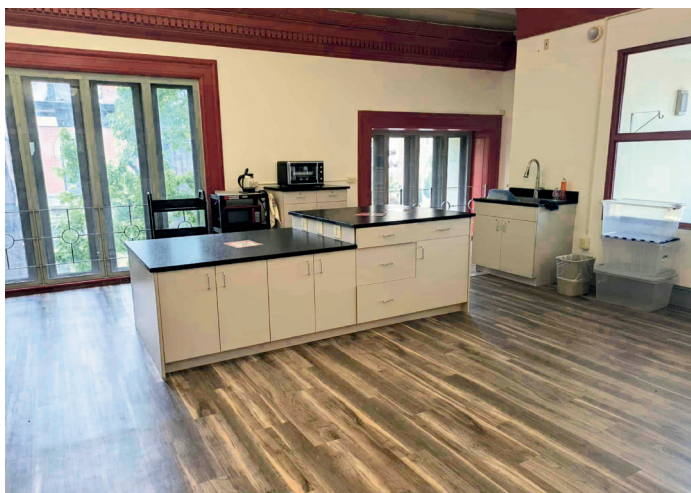
The completed kitchen includes new flooring, an eight foot island, a cabinet, electrical upgrades, and plumbing for a sink.

With the renovation complete, the Children's Department will offer after-school programming focused on socialization, creative development, and hands-on learning. Upcoming sessions will