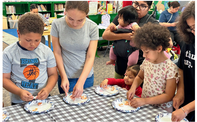
Our Food for Thought program, where children develop culinary skills, will now be hosted in the newly renovated kitchen area.

teach essential life skills such as cooking, construction, and handwork, helping young participants build confidence and practical knowledge for life.