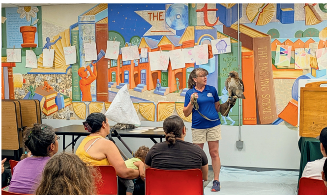
Our patrons met live hawks, snakes, and owls during our visit with Indian Run Environmental Center!