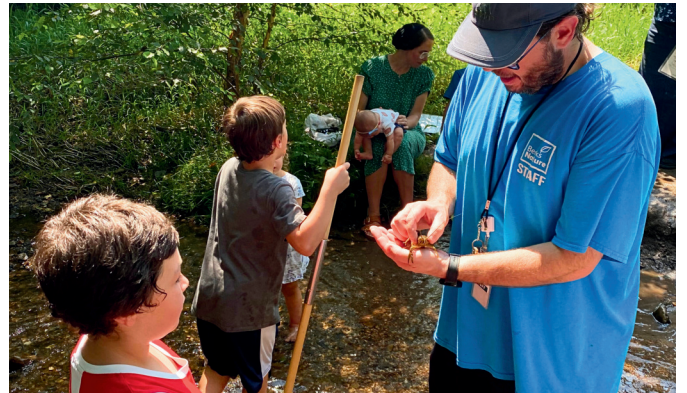
During our field trip with Berks Nature, library patrons had the opportunity to explore a variety of aquatic critters in Angelica Creek.